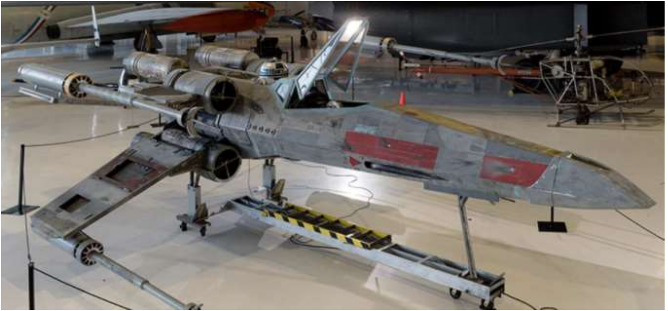
Star Wars™ X-Wing Starfighter

My family and I can decide what we want to do and see. There are airplanes, helicopters, and even a moon rock!