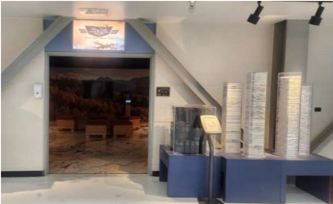
Harry Combs Gallery

If my family and I need a quiet and dark area, there is a quiet room where we can spend time together.